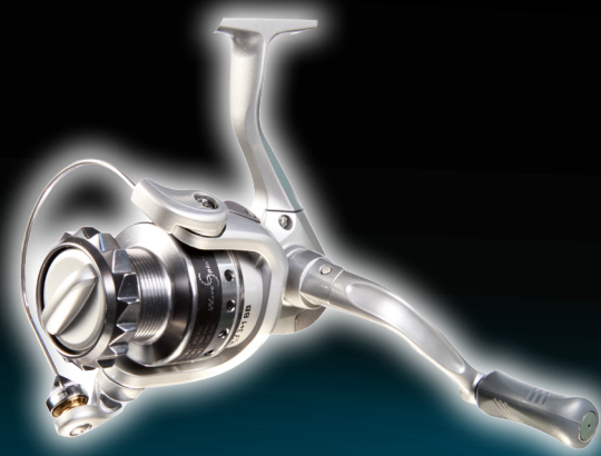
ZTR Models (New for 2011)