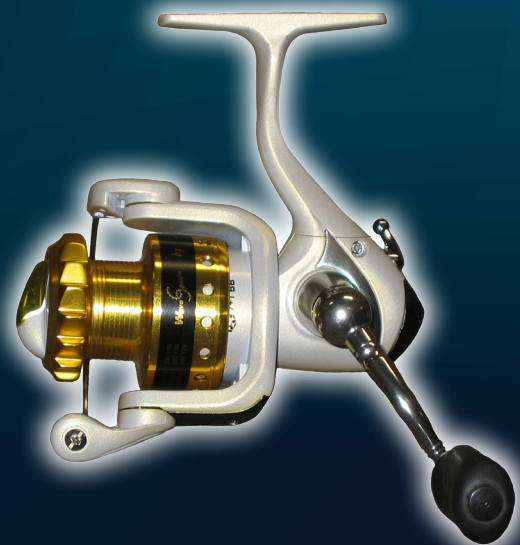
DH 3000z, DH 4000z (New for 2011)