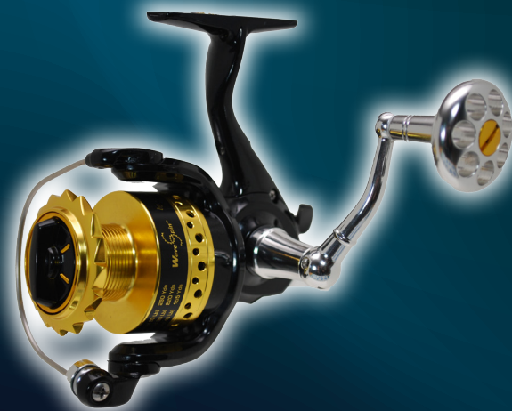
DH 3000, DH 4000, DH 5000